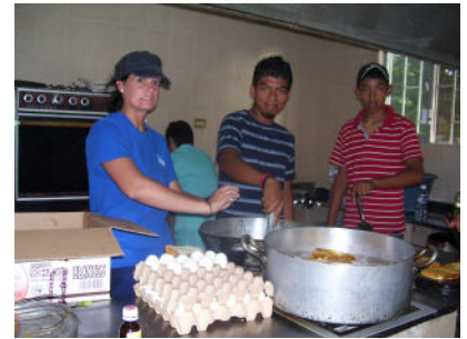
Even Kenzi got into the action. The official egg cracker!